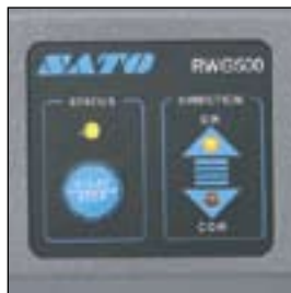
User-friendly Operation Panel