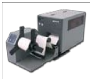
CL4xxe & LM4xxe