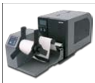
GTe408e & GL4xxe