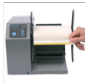
Up to 6" (inch) Label width Support