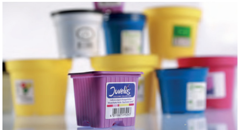
Self-adhesive identification labels for gardening