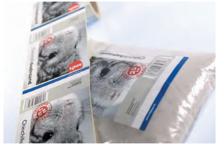
Self-adhesive display label for animal supplies

Companies from all sectors of industry have for more than 30 years put their trust in Weber Packaging Solutions labelling competency.