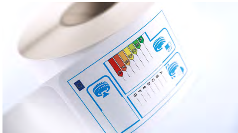
Self-adhesive label with special adhesive for labelling of tyres

We can offer you numerous labelling solutions to perfectly match your application. Label materials and adhesives are constantly improving through our innovations. Talk to us – we know the market better than most!