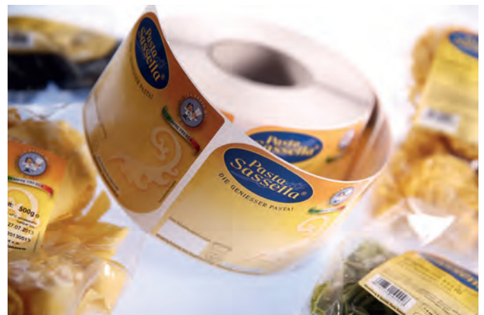
Self-adhesive shape-punched label for pasta