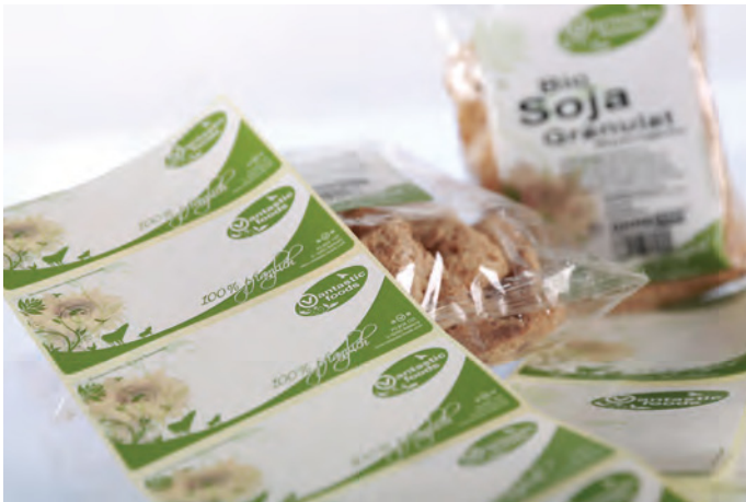
Self-adhesive pre-printed labels for bio products