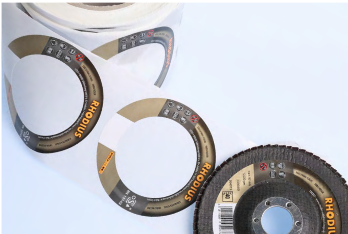
Self-adhesive, punched tag label for tools