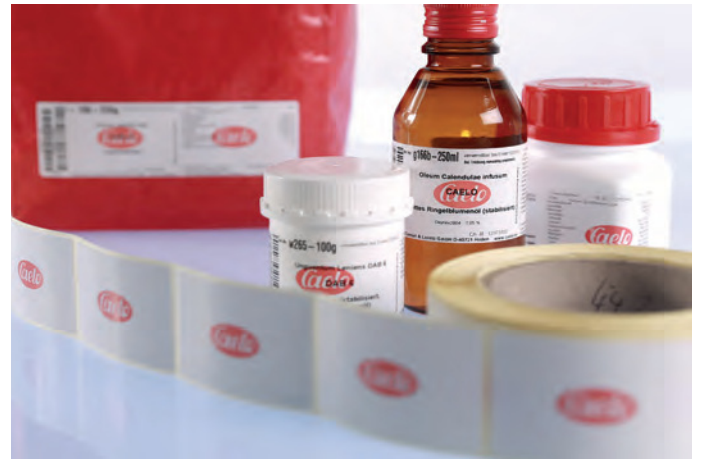
Self-adhesive pre-printed label for health products