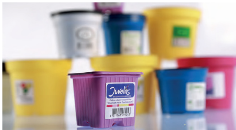
Self-adhesive identification labels for gardening