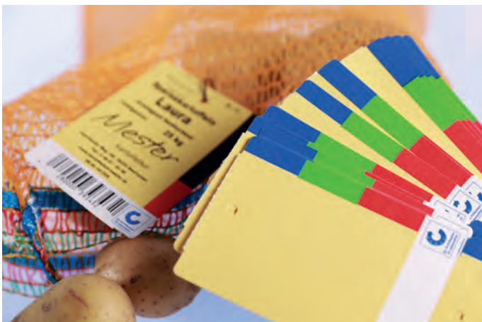
Cardboard tag for fruit and vegetables