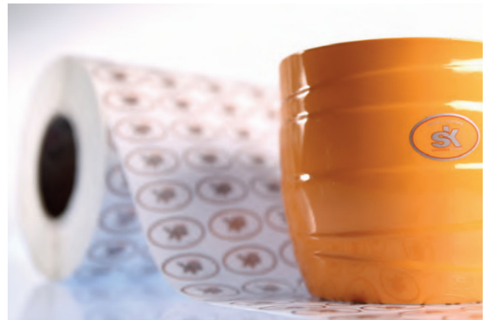
Self-adhesive brand label for ceramics