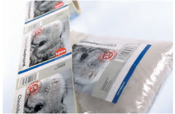
Self-adhesive display label for animal supplies

Companies from all sectors of industry have for more than 30 years put their trust in Weber Marking Systems labelling competency.