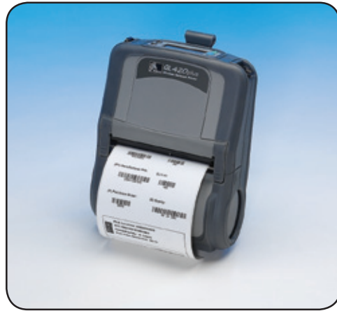
QL 420 Plus™

Bring the flexibility of wireless printing to your 4-inch label or receipt applications with Zebra's QL 420 Plus mobile printer. Built to survive the rigors of warehousing, distribution, and route accounting, the QL 420 Plus offers a mobile mount option to allow printing in a forklift or vehicle.