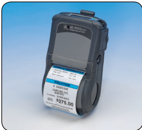
QL 320 Plus™

Zebra's popular QL 320 Plus mobile printer, for print widths up to 3 inches, was the first to offer the flexibility of 802.11b/g radio modules to meet evolving needs and wireless standards. Count on its durable design to endure tough manufacturing or shipping/receiving environments.