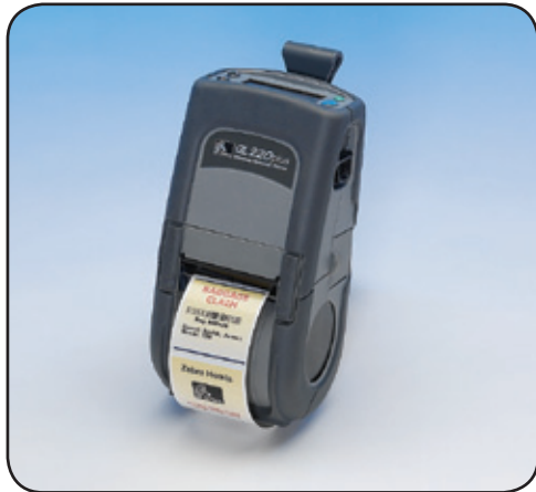
QL 220 Plus™

Take 2-inch label, ticket, and receipt printing where stationary and larger mobile printers dare not go—whether it's down store aisles, on hospital rounds, or onto retail pharmacy counters. Strap or clip on the sleek, 1.04-pound QL 220 Plus network-addressable label/receipt mobile printer and move with ease!